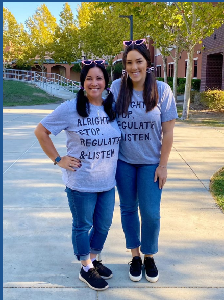
Twin Day at Gale Ranch