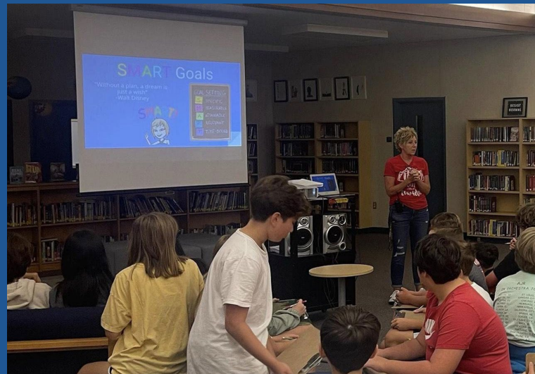
SMART Goal Lesson at Los Cerros