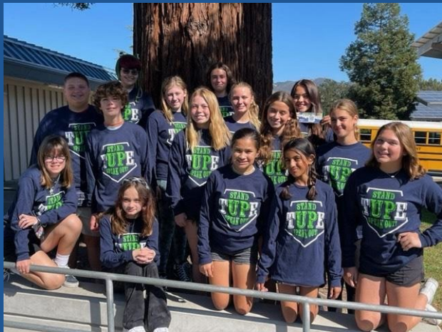
TUPE club at Los Cerros